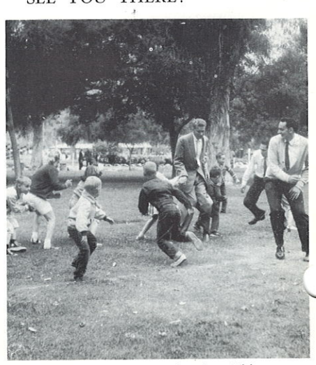
. . . and excitement for the children.