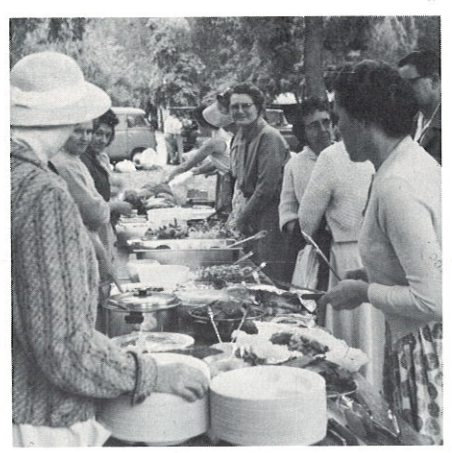
There will be plenty of food . . .

Mark the date on your calendar— THURSDAY, JULY 4. The time is 9 a.m. to 6 p.m. The place is Farnsworth Park which is located at the top