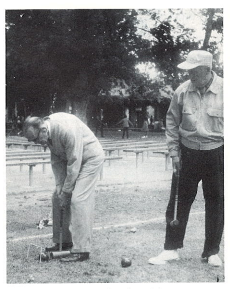
. . . fun for the adults

is having a proper amount of recreation, exercise and fellowship. This will all be provided in one major event. See the accompanying pictures to recapture the good time you had last year and come prepared for an even better time of real fellowship and recreation. So, come one, come all or else you will regret hearing about it through those who came and had such a good time. Yes, bring your mates who happen not to be in the Church.